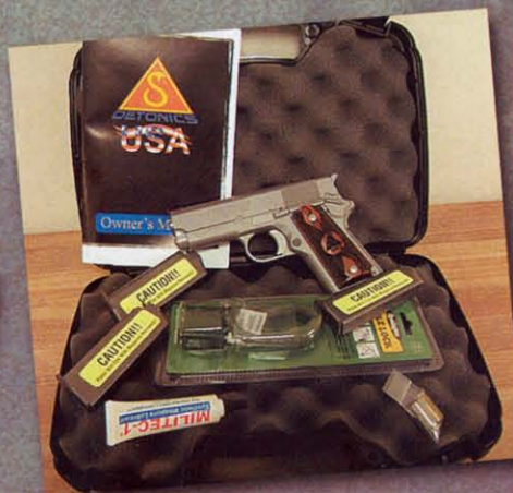
EAA's New New Dealer Direct Program from Detonics