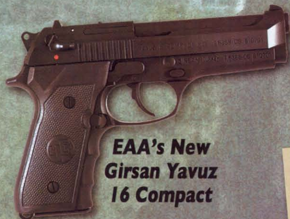
EAA's New Girsan Yavuz 16 Compact