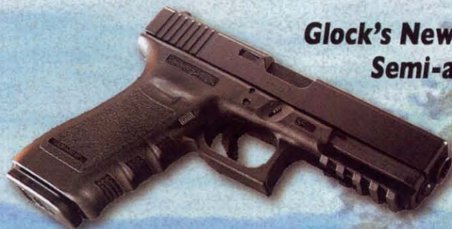
Glock's New .45 Semi-automatic Short Frame With New Features