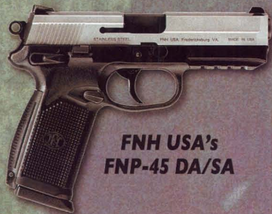
FNH USA's FNP-45 DA/SA