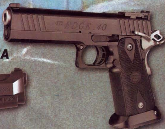
STI International - The Third Largest Exporter of Automatic Pistols in the USA